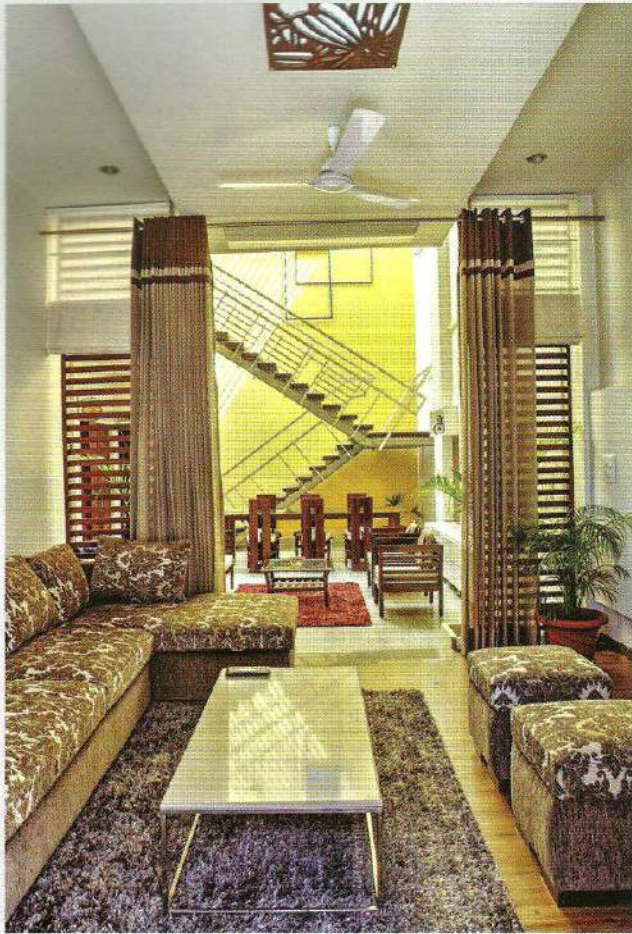
wooden laminate flooring in the drawing room with shades of brown and white used in fabrics and furnishings

two planter beds hosting palm. The jali here is made of wooden battens placed at equal distances in a wooden frame. Wooden laminate flooring has been used in the drawing room where shades of brown and white have been used in fabrics and furnishings. To moderate the contemporary and bring "Desi" feel, there was a need to bring in custom made furniture in the lobby which has an old school character to it with maroon in fabric to add vibrancy. The custom made dining table adds to the character and acts as a bridge between lobby and the internal staircase.